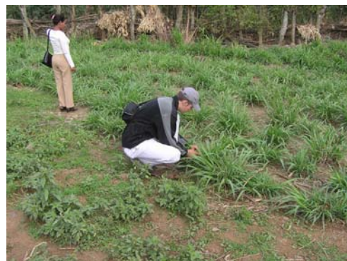
New plantings of improved accessions of Napier provide an option for farmers challenged to find better ways to feed their livestock.