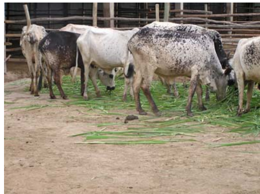
Cattle of local farmers fed with new accessions of Napier grass show good growth and milking ability. Over half of the farmers I surveyed grew Napier to support their cattle.

Napier grass is known and has been recognized as a cut-and-carry livestock feed. Continuous grazing does not allow the plant time to regenerate, and it often begins to die as it is not permitted to produce foliage. A majority of the farmers also expressed that they would be moving their Napier to better soil away from the fence row, where it would not have to compete with the fence row bushes. Since Napier grass needs good water and nutrients from the soil to produce at its highest potential, farmers saw problems when it is planted around other crops and was required to compete for resources.