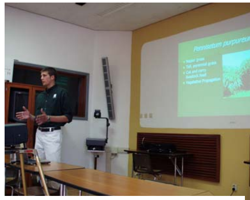
My concluding seminar to the staff at ILRI.

Everyone with whom I met and worked really molded my experiences in Ethiopia. They all provided me with such unique insight and greatly helped to make my project not only interesting, but truly a scientific learning experience. It is really hard to describe the feeling I had once my final results were written for the center. These people deserve more credit than can ever be written in a review paper. They are all so dedicated to their work. I only wish that I could bring them all to the United States to see our agricultural system and practices first hand. I know they would love it.