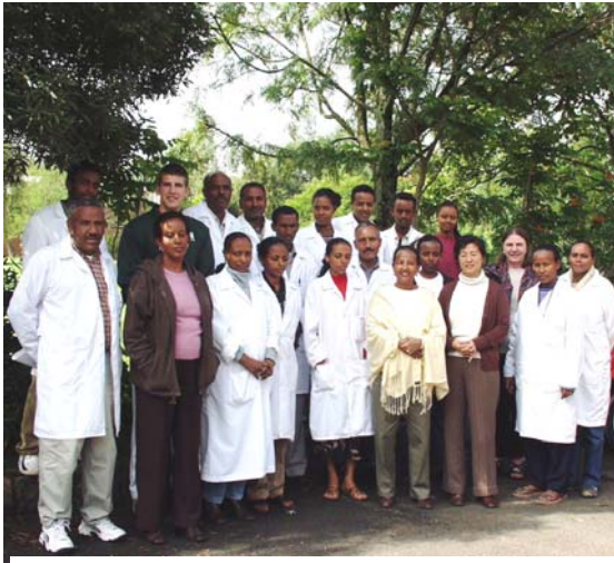
Researchers, staff (and me) at ILRI, Addis Ababa, Ethiopia.