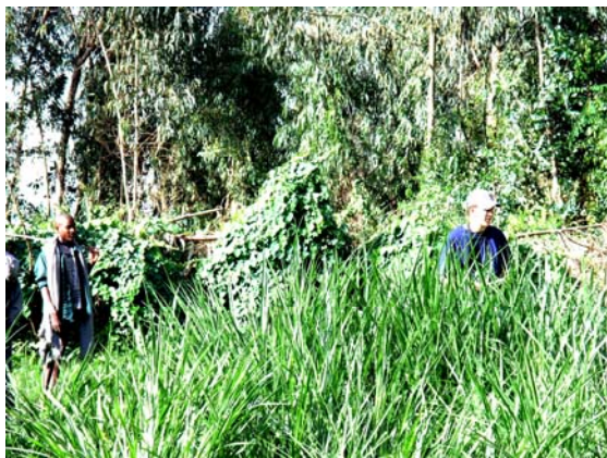
Napier Grass is tall, productive and very drought resistant.

Pennisetum purpureum , commonly known as Napier grass, is a forage that has received attention in the past few years for its use in smallholder farming systems as a cut-and-carry