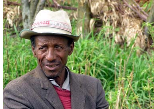
Four days were scheduled during the first full week of July for a small survey to interview farmers from the Babogaya and Genda Gorba villages.