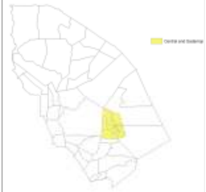
Central and Gadamoji

This page provides the update on the predicted livestock mortality index and the summary of the underlying data in Central and Gadamoji for March - September 2011 (Long Rain Long Dry, LRLD) insurance coverage period based on the data up to 23 Apr - 8 May. For information on the definition of these variables, see http://hdl.handle.net/10568/3408 .